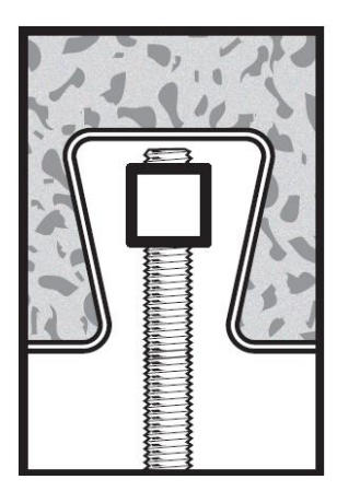
Attach threaded rod to Wedge Nut. Align parallel faces of the Wedge Nut along the length of the rib opening and insert all the way into the wider section of the opening