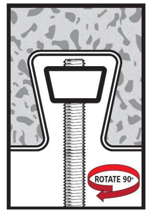
Rotate the rod assembled with the Wedge Nut at 90° making sure the tapered faces of the Wedge Nut are now facing the rib profile