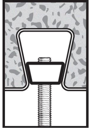
Pull down on the threaded rod so that the Wedge Nut tightly fits / seats in the rib opening of the BONDEK® profile.